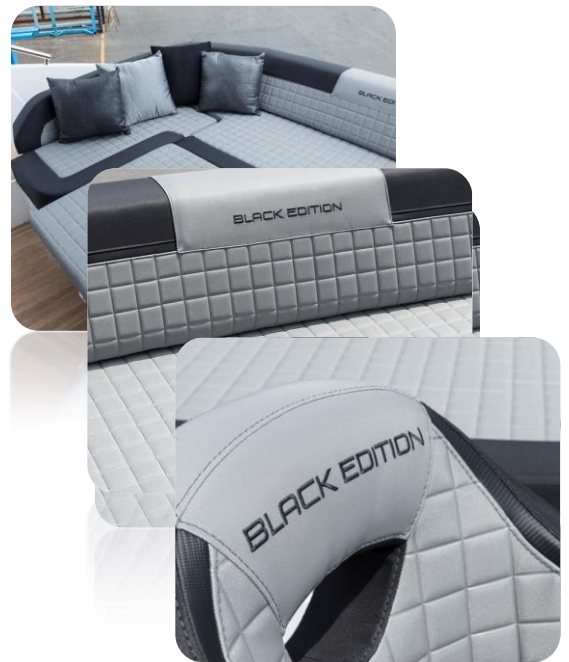
Black Edition exterior upholstery