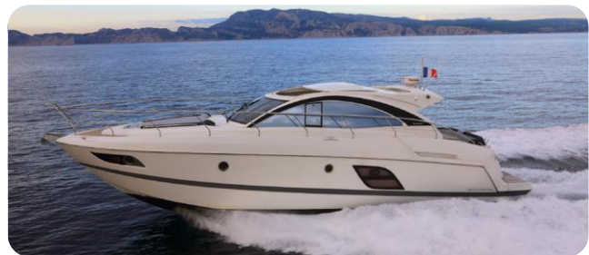
Black Edition exterior graphics for hardtop