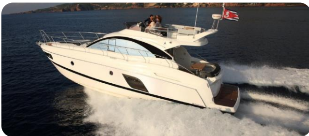
Black Edition exterior graphics for flybridge