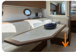
Convertible sofa in salon