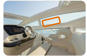
Opening hatch at helm