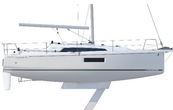
Profile - Swing keel version