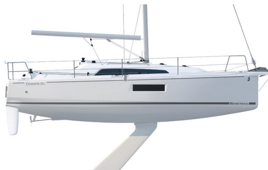
Profile - Lifting keel version