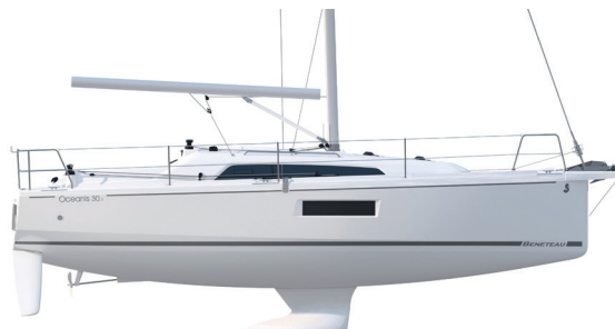
Profile - Shallow draught